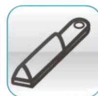
Angle of Spatula