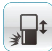
Packed Bulk Density