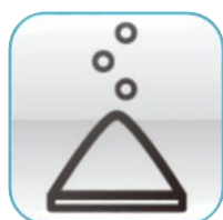
Angle of Repose