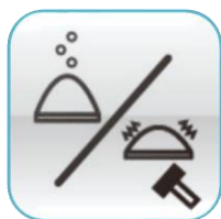
Angle of difference