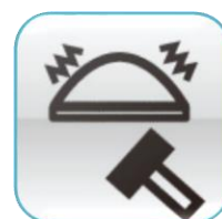
Angle of Fall