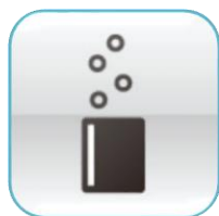
Aerated Bulk Density